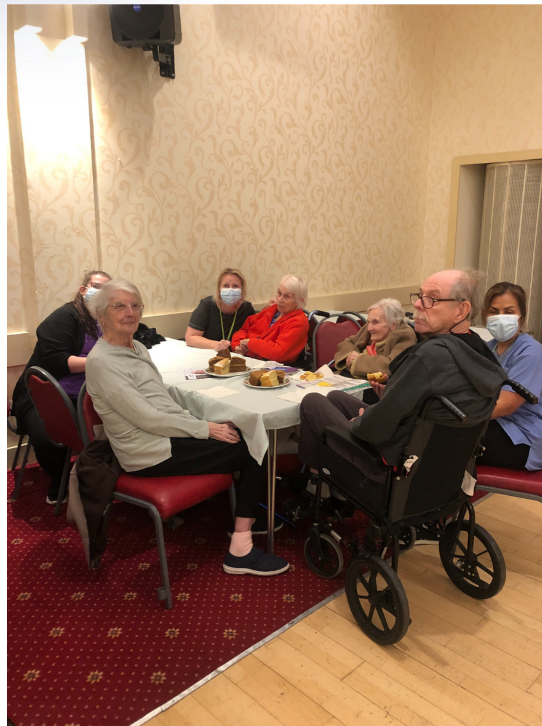
Tea Dance at Chipping Sodbury