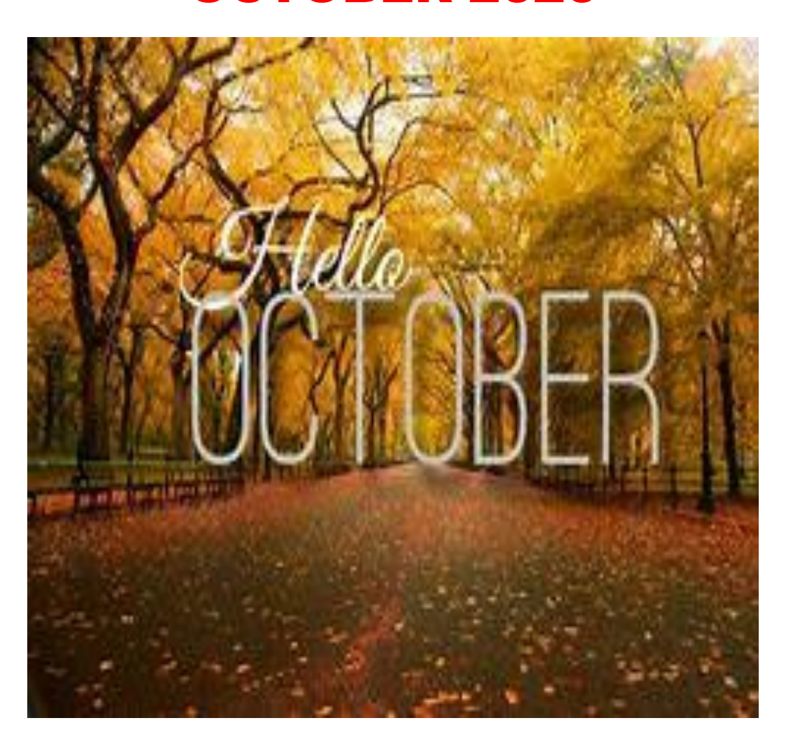
Welcome to our October Newsletter.

We appreciate how difficult it must be for our residents not seeing their loved ones but due to the enforced local lockdown we have still not been able to welcome visitors inside the home. Residents have been receiving window visits which appears to be providing some comfort to them and their families.