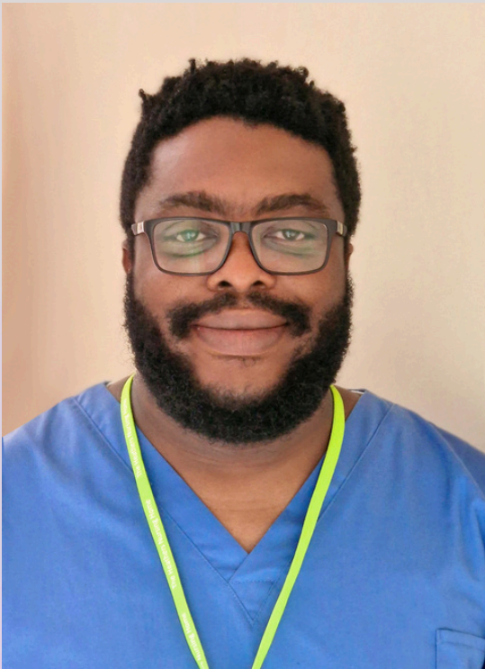
OLU CARE ASSISTANT