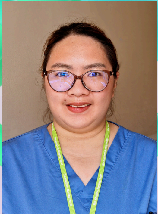
ANGEL CARE ASSISTANT